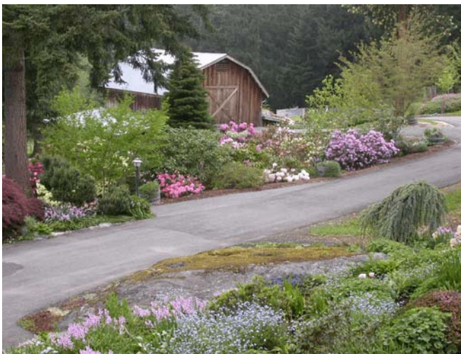
Two views of Allan and Liz Murrays's Garden